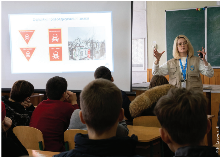
Ukrainian students attend an explosive ordnance risk education session with Humanity & Inclusion.

"The suffering will hit future generations," Meer adds. "They will live in fear of encountering these weapons and will bear the burden of clearing their land when American cluster munitions fail to explode on impact."