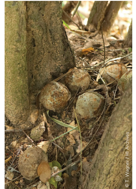
Cluster munition bomblets in Laos.

1,172 people killed or injured by cluster munitions in 2022